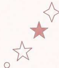
G.NAVYA PUSHPA CHANDRIKA... 23011-C-013.